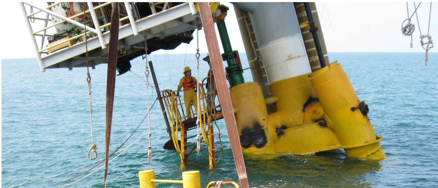
Example of debris removal to lighten the topside loading on a damaged wellhead platform

The Damaged Platform Structural Survey includes a thorough review of the as-built platform, accommodations, equipment, and wellhead/wellbores both above sea level and below. This is compared to the actual condition of the platform after damage (through pictures and measurements) to model the damaged platform for developing platform removal modelling, planning safe access, and all future intervention planning.